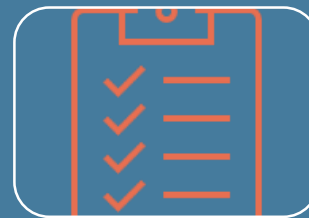
By-law & Policy