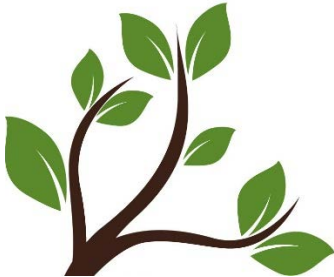
The Leaves – brings new $$ to community