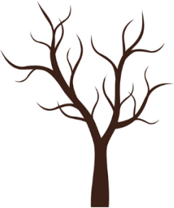
The Branches – supports and is supported by local businesses